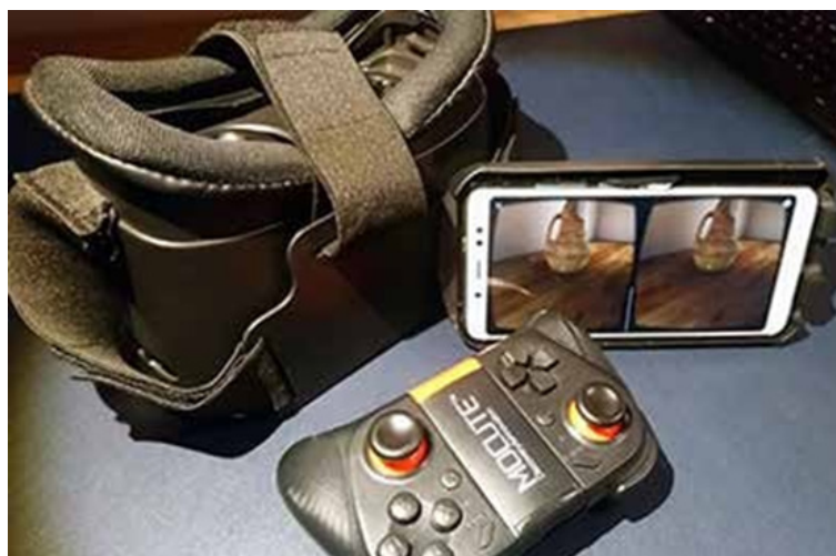
Figure 1. The test setup: VR frame, Bluetooth controller with a joystick, Android mobile device

The controlled experiment was conducted with Generation Z. The experiment split into two halves, as seen in the first part, where they toured a virtual exhibit displaying 3D-scanned artifacts from Samarkand. This exhibition worked in Unity graphics engine and Google VR SDK for Android using VR BOX for Android devices with Redmi Note 5 and controlled by a Mocute-050 Bluetooth controller. The experiment was conducted in various places, including computer labs and classrooms where possible, sitting or standing, moving freely, and free from distractions (such as noise and crowd). The virtual exhibition offered a playground for participants to look around within the VR space and three other rooms designed as part of the main sightseeing experience. During this phase, the researcher observed participant engagement and behaviors.